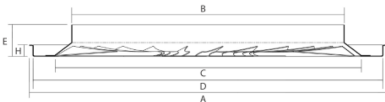
SSW-HC-12-T Tegular Ceiling Type