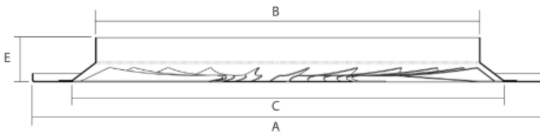
SSW-HC-12-L Lay-in Ceiling Type